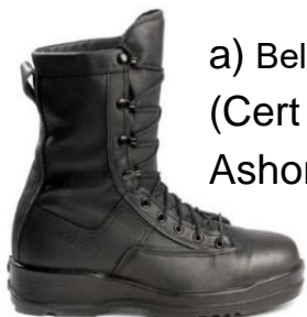
a) Belleville Shoe Company, Style 800ST 'Flight Deck Boot' (Cert No. 15B27-002409-224-88) Ashore/Shipboard/Flight Deck (Unisex sizing)