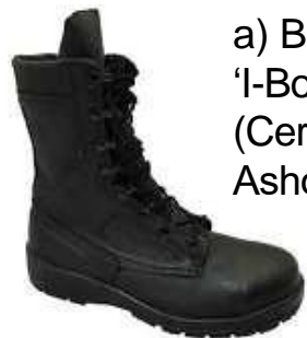
a) Belleville Shoe Company, Style 490ST 'I-Boot-4' (Cert No. 15B36-002471-250-88) Ashore/Shipboard (Men's/Unisex)