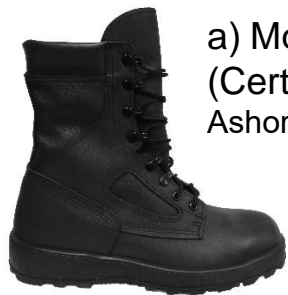
a) McRae Footwear, Style 9052 'I-Boot 5' (Cert No. 15B27-002534-261-88) Ashore/Shipboard/Flight Deck (Men's sizing)