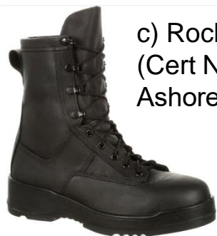
c) Rocky Brands, Inc., Style 795B (Cert No. Number 15B27- 002383-224) Ashore/Shipboard/Flight Deck (Men's/Unisex)