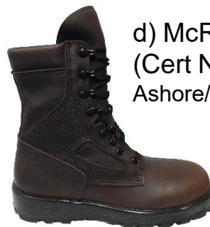
d) McRae Footwear, Style 8052RF 'I-Boot 5' (Cert No. 15BR127-002544-262-88) Ashore/Shipboard/Flight Deck (Women's sizing)