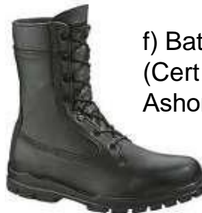
f) Bates Shoe Company, Style 1621 (Cert No. 15B30- 002034-101) Ashore/Shipboard (Men's)