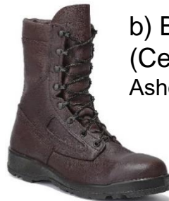
b) Belleville Shoe Company, Style F339ST (Cert No. 15BR127-002512-262-88) Ashore/Shipboard/Flight Deck (Women's sizing)