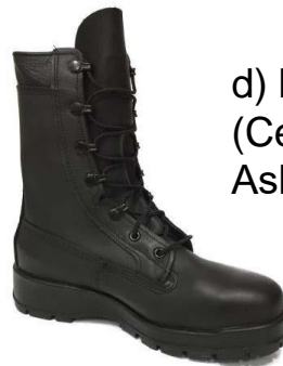
d) Belleville Shoe Company, Style 360ST (Cert No. 15B30- 001999-101) Ashore/Shipboard (Men's)