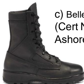
c) Belleville Shoe Company, Style 495ST 'I-Boot 5' (Cert No. 15B27-002510-261-88) Ashore/Shipboard/Flight Deck (Men's sizing)