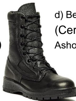
d) Belleville Shoe Company, Style F495ST 'I-Boot 5' (Cert No. 15B27-002509-262-88) Ashore/Shipboard/Flight Deck (Women's sizing)