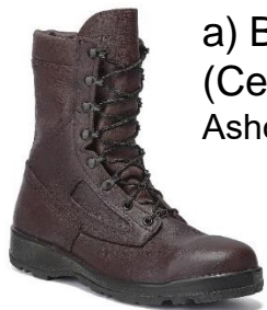
a) Belleville Shoe Company, Style 339ST (Cert No. 15BR127-002511-261-88) Ashore/Shipboard/Flight Deck (Men's sizing)