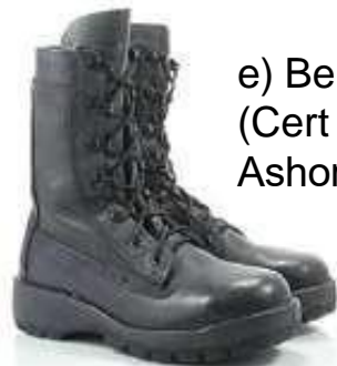
e) Belleville Shoe Company, Style F360ST (Cert No. 15B30- 002380-100-88) Ashore/Shipboard (Women's)