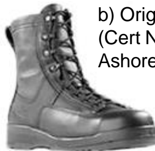
b) Original Footwear, Style Altama 425101 (Cert No. 15B27- 002393-224) Ashore/Shipboard/Flight Deck (Men's/Unisex)