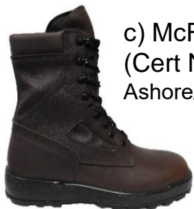
c) McRae Footwear, Style 8052 'I-Boot 5' (Cert No. 15BR127-002543-261-88) Ashore/Shipboard/Flight Deck (Men's sizing)